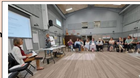
Akwesasne Community Engagement

Almost 260 individuals provided input in the initial phase of engagement.