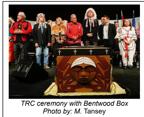
TRC ceremony with Bentwood Box

The Truth and Reconciliation Commission (TRC) released its Final Report in 2015, including 94 Calls to Action (CTA) on how governments of all levels, institutions, and residents of Canada can support the process of reconciliation. The CTA address a wide range of areas including child welfare, education, health, justice, language, and culture. These CTA are meant to address the ongoing impact of residential schools on survivors and their families and describe a path for systemic changes in public policy that are necessary for Indigenous and non-Indigenous Peoples to move forward together with a shared vision of reconciliation. Five of the CTA specifically refer to municipalities and eight refer to all levels of government (see Appendix A).