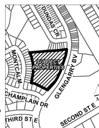
LOCATION MAP FOR CD 2009-02

The properties to which this application applies are depicted to the right.