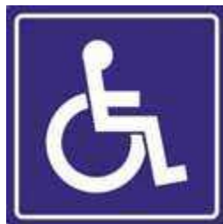
International Symbol of Access

Symbols – The International Symbol of Access shall be used where facilities or their elements are required to be identified as accessible.